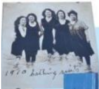
Beach House Murals