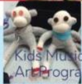
Kids Music & Art Programs