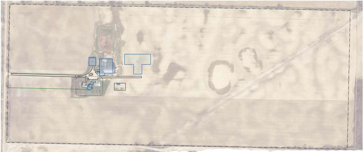
SITE PLAN - OVERALL