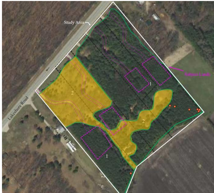
Image Source: Figure 5 – MTE Information Gathering Form for activities that may affect species or habitat protected under the Endangered Species Act .

Proposed Development: Since the existing A2 Zone acts as a holding zone, rezoning to R6 is necessary on three of the lots (10045, 10057 and 10063) in order to construct a house at all. The rezoning is required on 10039 Lakeshore Road to allow the house to be built further back on the lot. The proposed building envelopes on these lots are identified in the first image to the right. The second image below identifies the building envelope created for the middle lot (10051) by the 2018 rezoning. Note that the areas identified as “EP-WD” were instead zoned to “EP-NC” by the rezoning.